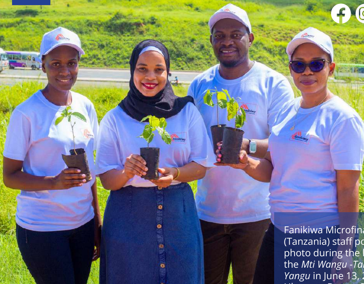
Fanikiwa Microfinance (Tanzania) staff pose for a photo during the launch of the Mti Wangu -Tanzania Yangu in June 13, 2023 at Ubungo , Dar-es-Salaam City